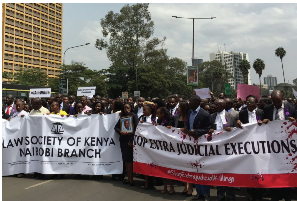
Kenyans, including human rights activists, lawyers, and taxi operators, peacefully protest in Nairobi against alleged pervasive killings and enforced disappearances linked to police, July 2016.

The blanket exclusion of the media is unjustifiable, unreasonable, and unconstitutional unless the legal (and security) reasons for the exclusion are explained. Yet, when questioned as to why it had excluded media, the NPSC failed to give a reasonable explanation, arguing that excluding media was the result of logistical challenges. 27 This contradicts another explanation, from February 2017, that it was due to national security. 28