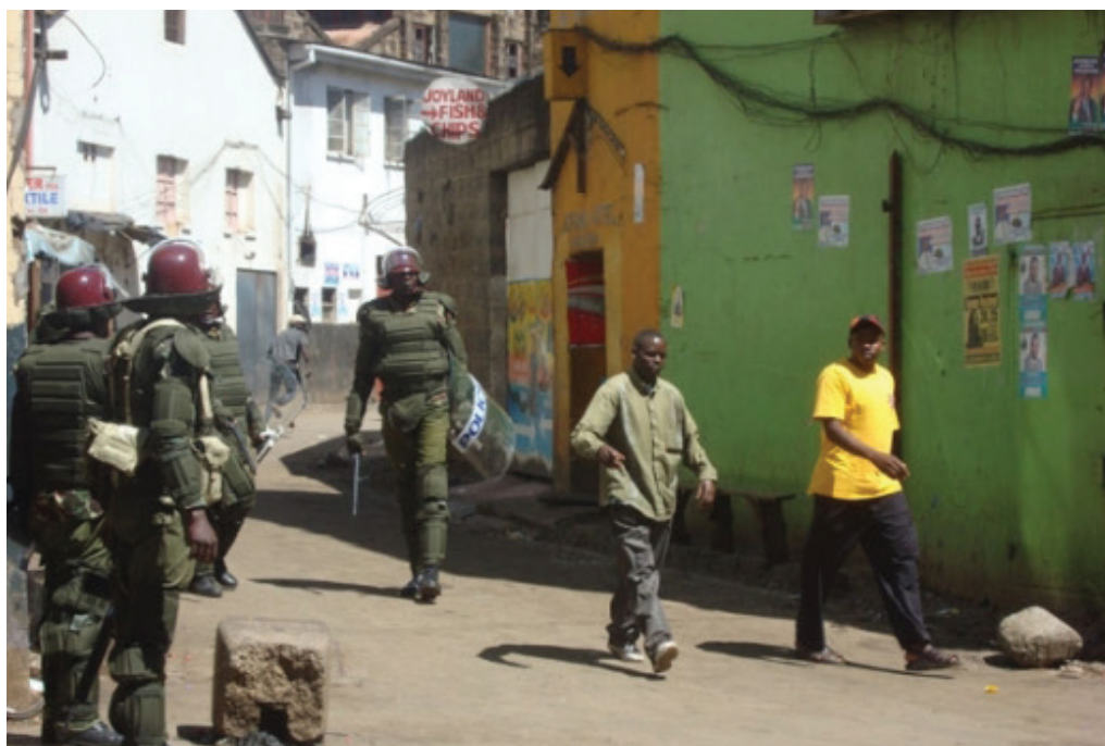
Police on the streets during election violence, January 2008

The NPSC's vetting process is part of efforts to reform Kenya's National Police Service, including by removing human rights violators from its rank and file and increasing the trustworthiness and accountability of the police service. The number of police officers to be vetted is approximately 77,500. 11 As of December 2016, the NPSC had vetted approximately 2,470; 12 the current number remains unclear. 13