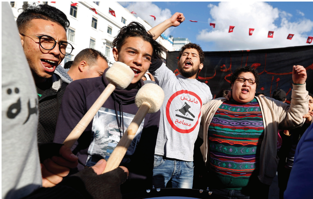
Photo: Young people, including a young man (center) wearing a T-shirt with the Maneesh M'sameh logo, protest against rising prices and tax increases in Tunis, Tunisia, on January 13, 2018 (Reuters).

the same luxury of time or resources to support their work. Awareness and sensitivity to that are key to developing effective strategies and partnerships. 30