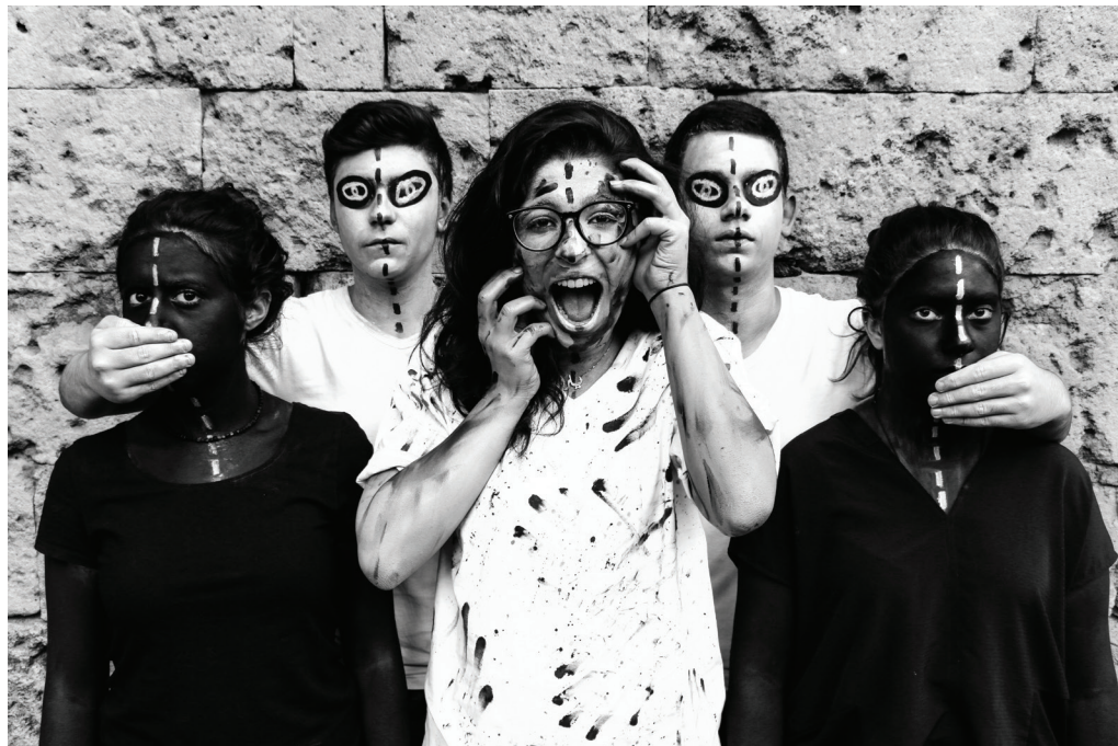
Titled “Last Round,” this photo by Sami Ouchane took second prize in a 2015 photography contest organized by ICTJ in Lebanon for youth born after 1990 on the topic of the Lebanese civil war and its legacy (ICTJ).

leaders. They are a key constituency responsible for consolidating the new political order, building democratic values, and sustaining peace. Drawing on reflections from the peacebuilding field, Siobhán McEvoy-Levy says that a lasting peace will depend “on whether the next generations accept or reject it, how they are socialized during the peace process and their perception of what that peace has achieved.” 13 Stephanie Schwartz explains that if young people are given spaces to have their voices heard