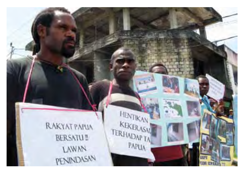
Abepura, Indonesia. Civil society groups in Papua holding a demonstration to commemorate the violence against indigenous people in Papua and demanding the establishment of a human rights court for Papua.