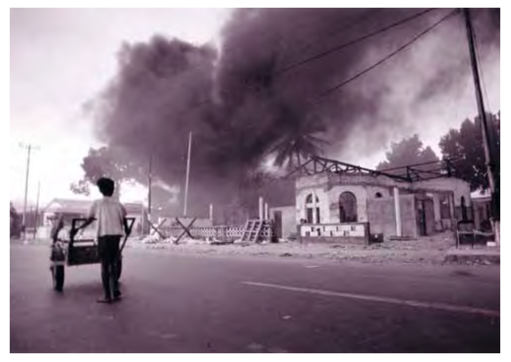
Jakarta, Indonesia. A child carrying a cart looking for anything salvageable during the riots in Dili, which followed the announcement of the referendum results.