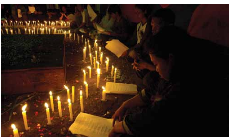
Jakarta, Indonesia. Communities and families of victims commemorating the five year anniversary of the May 1998 tragedy at Klender Mall, one of the sites where many lives were lost.

Since its inception, the commission's membership has included women from the conflict areas of Papua, Maluku, Aceh, and East Timor (prior to 1999 when East Timor was still a de facto part of Indonesia). Komnas Perempuan has interpreted its mandate to include truth-seeking in places where mass gender-based violence has occurred, and it has focused on ensuring nonrepetition. The commission has emphasized the historical causes of mass violations against women and utilized these findings to instigate institutional reform and dialogue about cultural norms.<sup>39</sup> It has also conducted inquiries on gender-based violence in Aceh, Poso, Jakarta, and Papua, made a