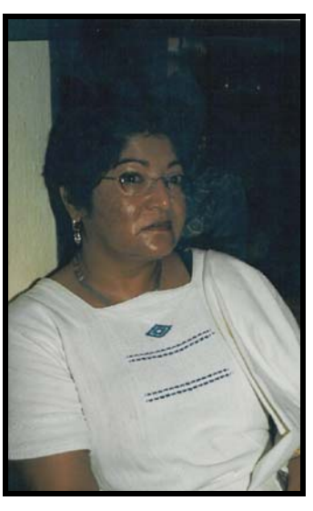
Yasmin Sooka (International)